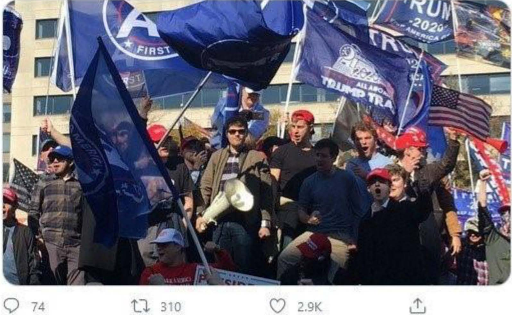
December 19, 2020, a tweet from Nicholas Fuentes