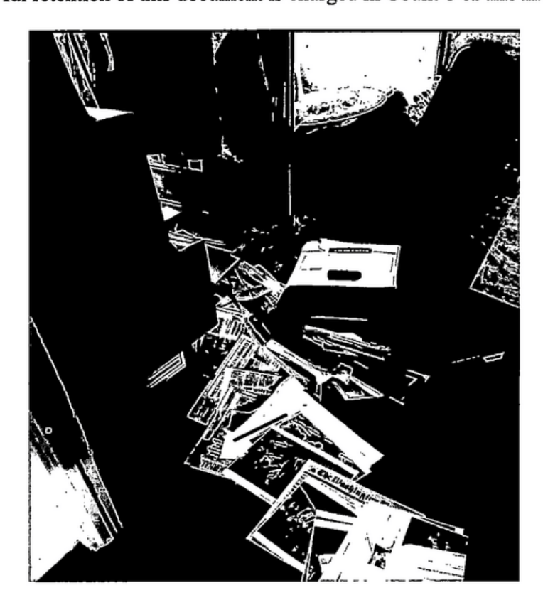
TRUMP's Disclosures of Classified Information in Private Meetings

TO USA, FVEY," which denoted that the information in the document was releasable only to the Five Eyes intelligence alliance consisting of Australia, Canada, New Zealand, the United Kingdom, and the United States. NAUTA texted Trump Employee 2, "I opened the door and found this..." NAUTA also attached two photographs he took of the spill. Trump Employee 2 replied, "Oh no oh no," and "I'm sorry potus had my phone." One of the photographs NAUTA texted to Trump Employee 2 is depicted below with the visible classified information redacted. TRUMP's unlawful retention of this document is charged in Count 8 of this Indictment.