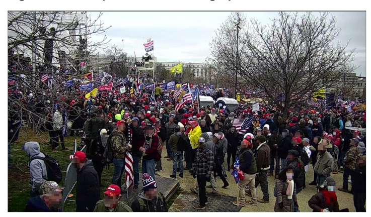
Figure 3: Closeup and Aerial Photographs of Crowds Outside the Capitol Building on January 6, 2021