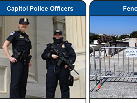
Figure 2: U.S. Capitol Police Physical Security Included in the Civil Disturbance Unit's Plan for January 6, 2021

Officers, including Civil Disturbance Unit officers, are used to restrict pedestrian access to outside the bike rack perimeter.