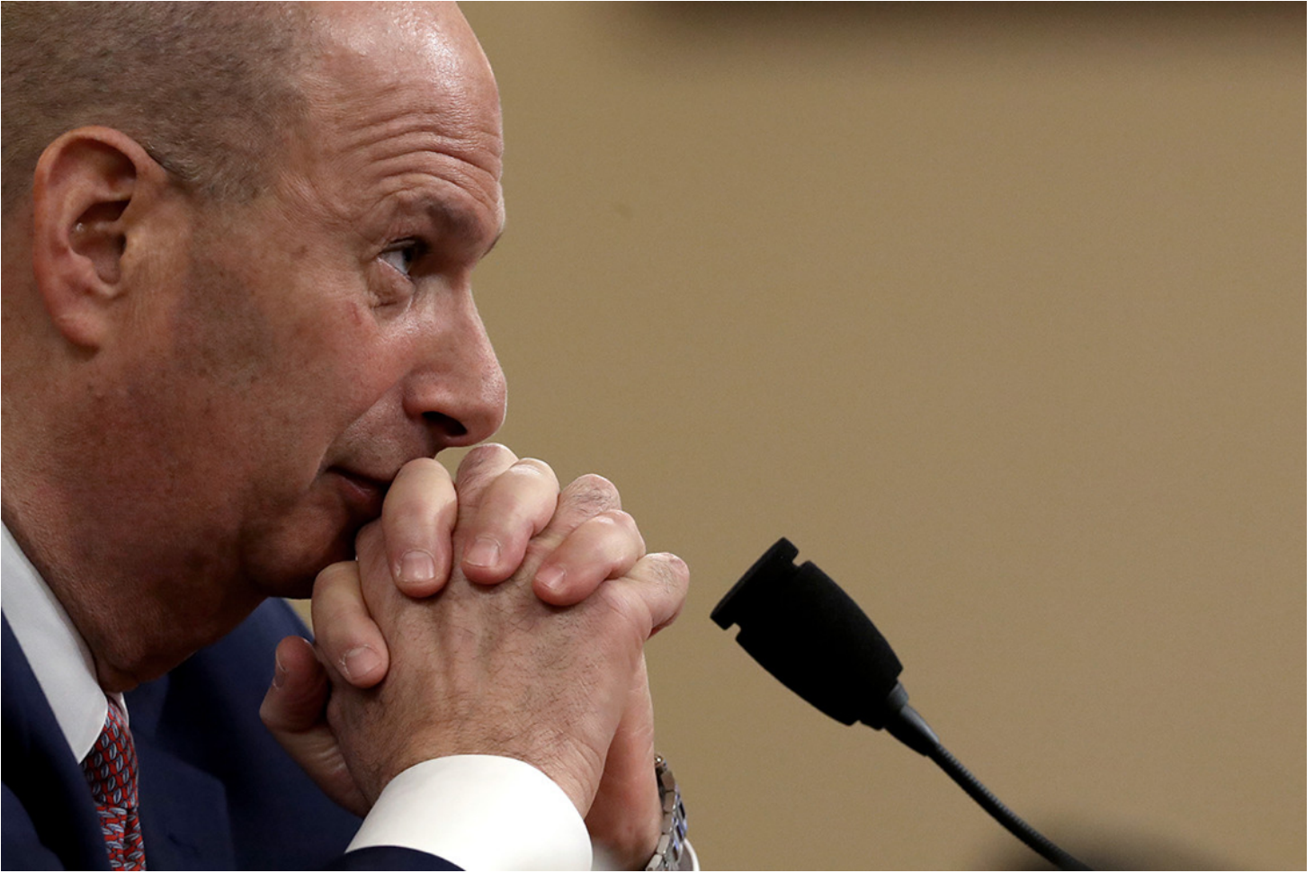
Gordon Sondland testifies.

“The vice president never had a conversation with Gordon Sondland about investigating the Bidens, Burisma, or the conditional release of financial aid to Ukraine based upon potential investigations,” Short said in a statement. “Ambassador Gordon Sondland was never alone with Vice President Pence on the September 1 trip to Poland. This alleged discussion recalled by Ambassador Sondland never happened.”