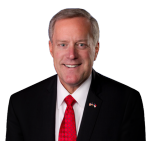
MARK MEADOWS Proudly Serving North Carolina's 11th District

For 9 months we've warned them consequences were coming, and for 9 months we've heard the same excuses backed up by the same unacceptable conduct. Time is up and the consequences are here. It's time to find a new Deputy Attorney General who is serious about accountability and transparency."